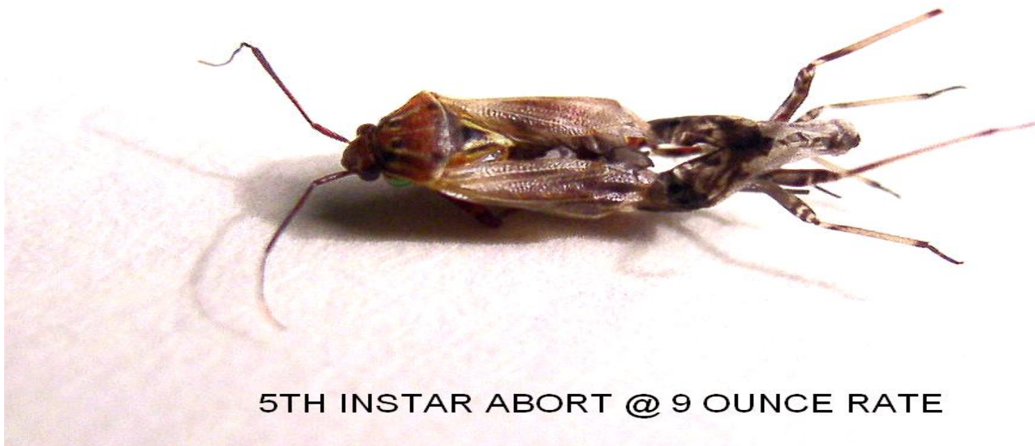
Tarnished Plant Bug Nymph