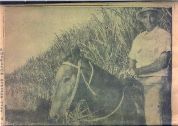
ABARA VIATOR—SUGAR CANE AND A WAY OF LIFE