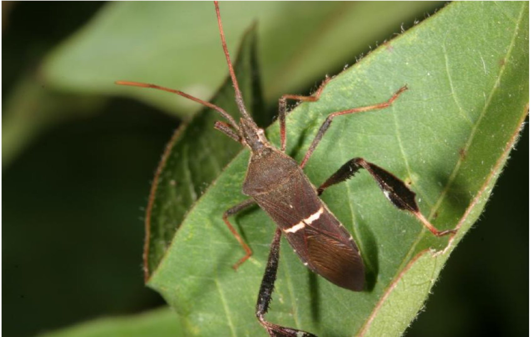
Leaf footed bug