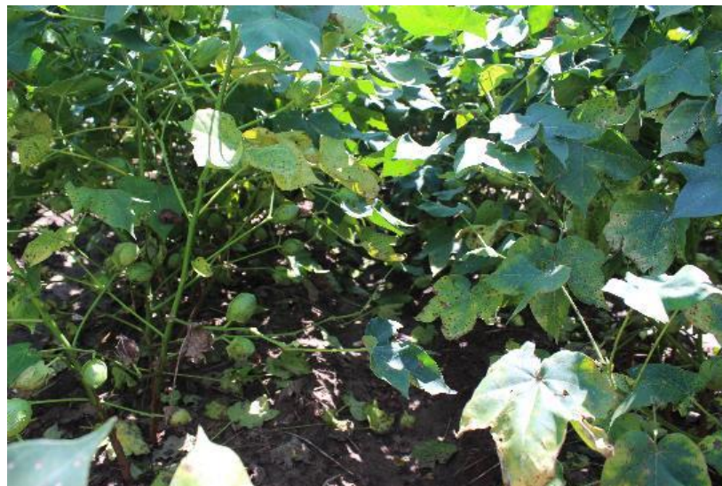
Elatus, 6.0 oz Sequential: 1219.2 Lbs Lint/A (+125)