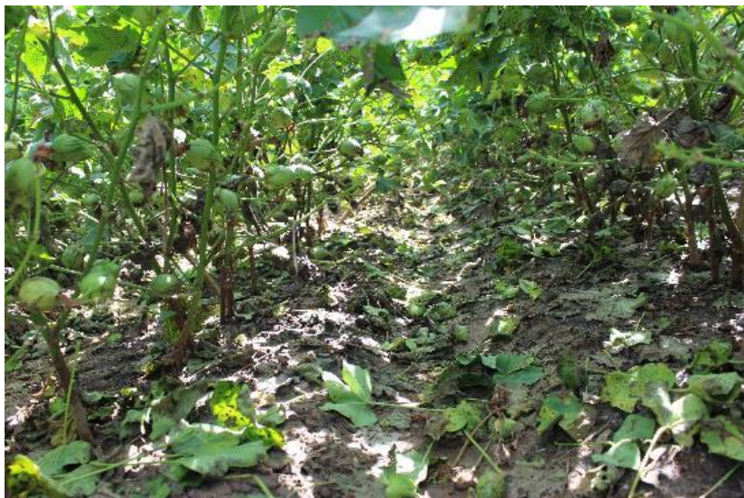
Untreated: 1093.8 Lbs. Lint/A