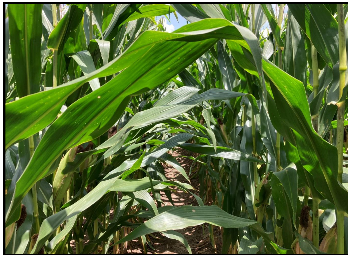
Xyway LFR @ 12 oz/A