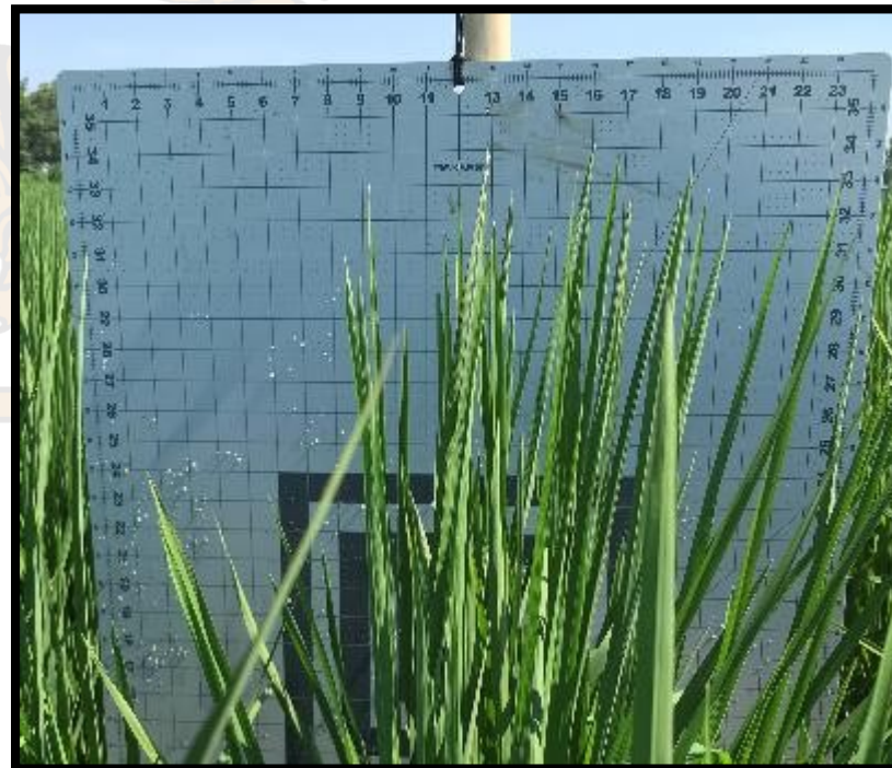
Right, Tiger 90, cold water levee.