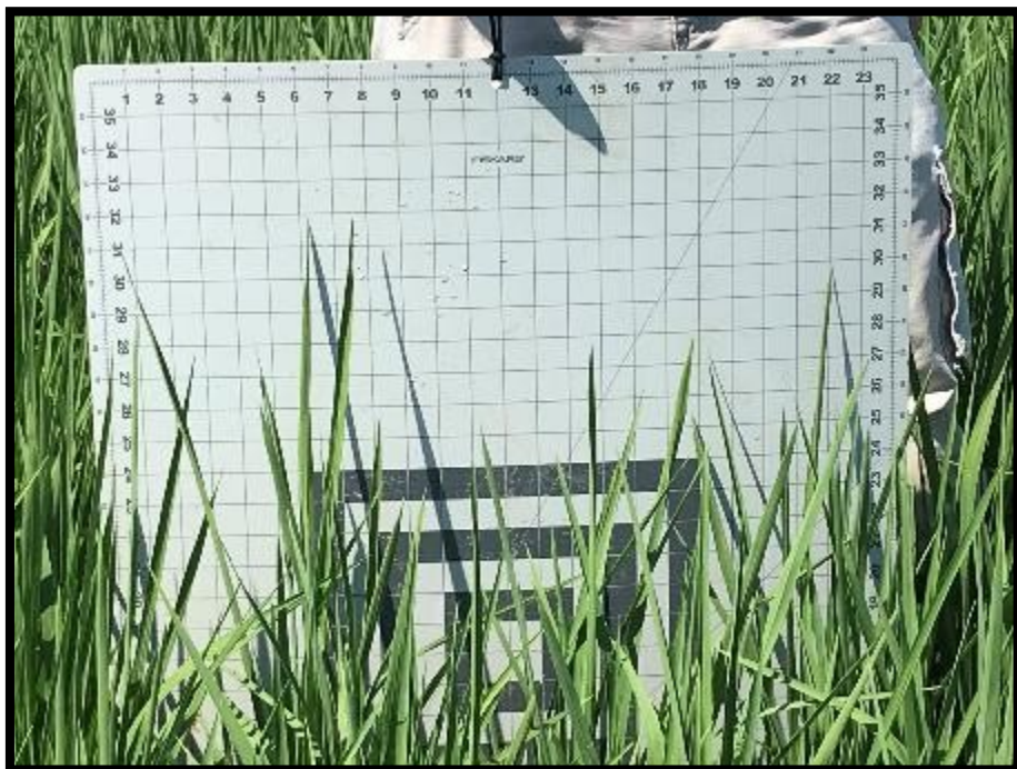
Left, farmer's UTC, bottom of field.